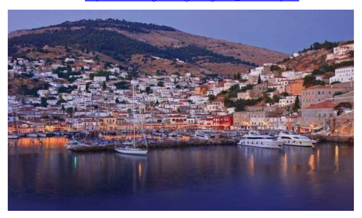
To learn more about Hydra Island, please visit <a href="https://www.hydradirect.com/about-hydra/">https://www.greeka.com/saronic/hydra/</a>

The entire island of Hydra is a preserved national monument and has retained all its 17th & 18th century charm and quaintness. Hydra town, built in the shape of an amphitheatre on a slope overlooking the Argosaronic gulf, is one of the most romantic destinations in Greece. Traditional stone mansions, narrow cobblestoned streets, secluded squares and above all the banning of cars and the use of around 500 donkeys as means of public transportation, explain the reason why Hydra preserved its distinctive atmosphere through the passage of time. The island experienced exceptional economic growth in the past thanks to its great naval and commercial activity. The island is one of the most serene destinations near Athens, as a ferry from Athens to Hydra, will get you to Hydra in just 2 hours. It's picturesque and very photogenic beauty as well as a range of stunning locations, makes it a thriving venue for conferences. http://www.visitgreece.gr/en/greek_islands/hydra